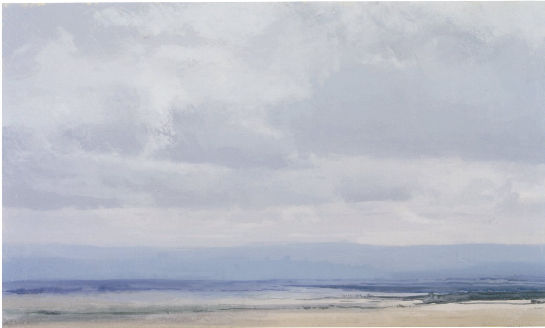
cover Journey to the source XII 2012 OIL & BEESWAX ON LINEN 200 × 214 cm