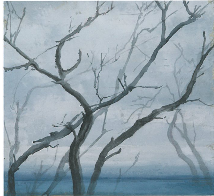
A calligraphy of limbs No. 2 2012 OIL & BEESWAX ON LINEN 46 × 49 cm