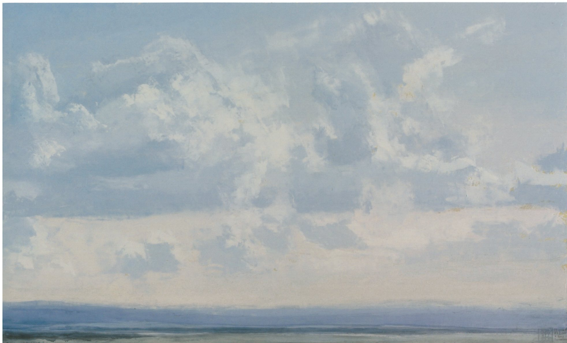
A long succession 2012 OIL & BEESWAX ON LINEN 91 × 300cm