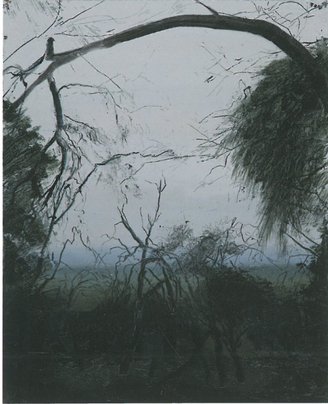
After the rain 2010 OIL & BEESWAX ON LINEN 57 × 46 cm