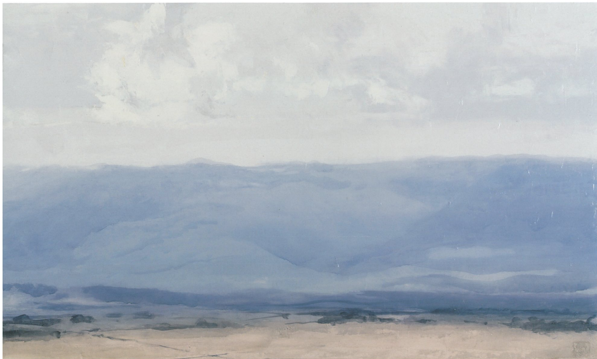
A procession of shadows 2012 OIL & BEESWAX ON LINEN 91 × 300 CM