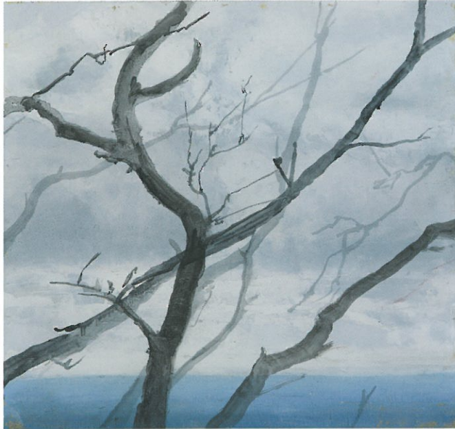
A calligraphy of limbs No. 1 2012 OIL & BEESWAX ON LINEN 46 × 49 cm