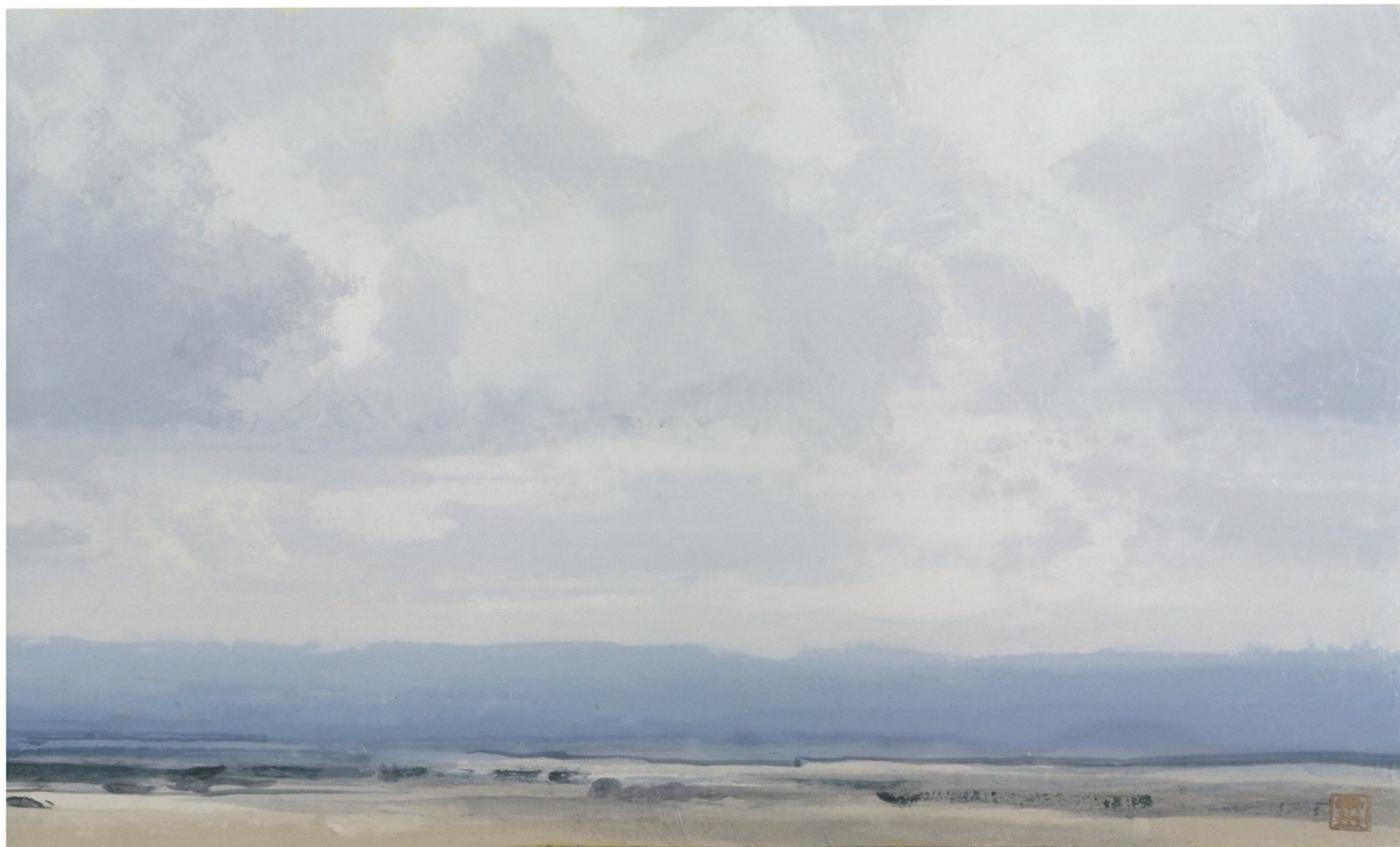
The inevitable passage of summer 2012 OIL & BEESWAX ON LINEN 91 × 300 CM